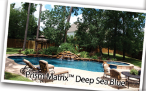
Prism Matrix™ Deep Sea Blue