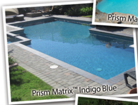
Prism Matrix™ Indigo Blue