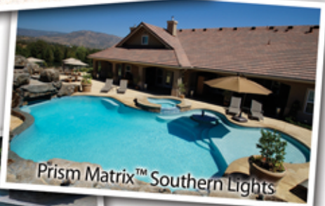
Prism Matrix™ Southern Lights