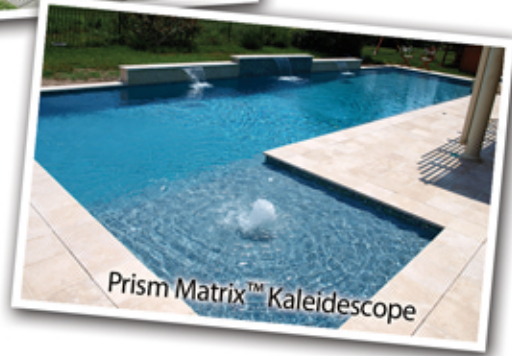
Prism Matrix™ Kaleidoscope