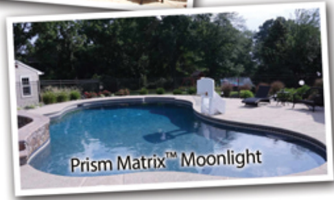
Prism Matrix™ Moonlight