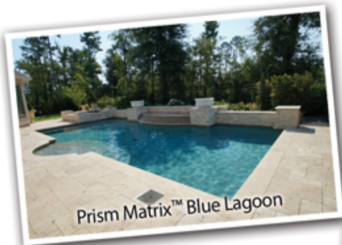
Prism Matrix™ Blue Lagoon