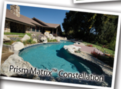
Prism Matrix™ Constellation