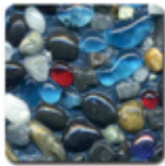
Deep Sea Blue