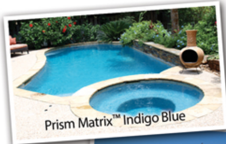
Prism Matrix™ Indigo Blue